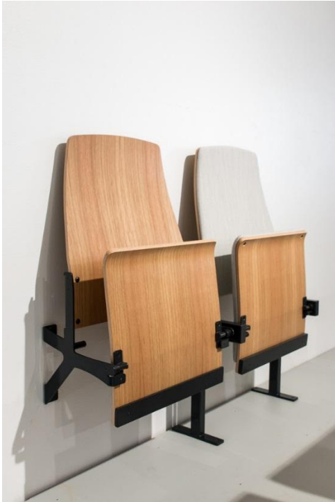
EduWall and Edu